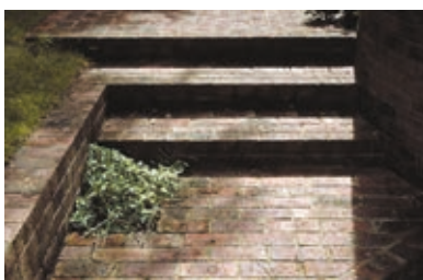
Chailey Multi Stock Paver Henley-on-Thames