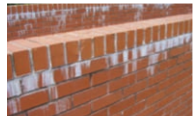
Lime stains emanating from mortar. No damp proof membrane has been incorporated under the brick edge capping.

A strong mortar mix is necessary for the durability of the brickwork. Do not recess mortar joints. Consider whether brickwork will be adjacent roadways where de-icing salts will regularly be used.