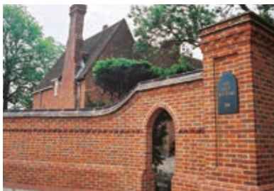
Swanage Handmade Multi Milton Keynes